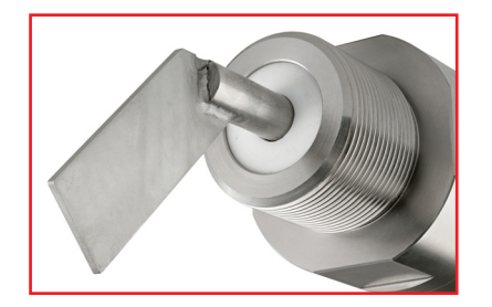
Maintenance-free due to the completely closed design.