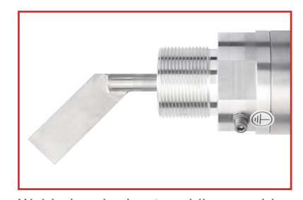
Welded and robust paddles provide a high level of system availability.

MBA Instruments GmbH, Friedrich-List-Strasse 5, 25451 Quickborn, www.mba-instruments.de, info@mba-instruments.de